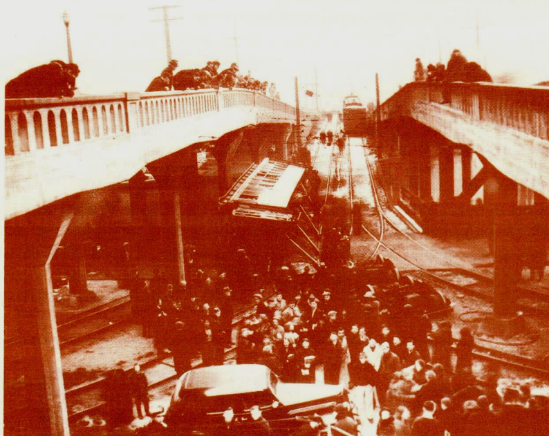
WRECK AT Avalon Way and Spokane Street, Jan. 8, 1937, worst in city streetcar history.

Other sessions in the program are scheduled for Wednesday, April 15, and Wednesday, May 20. Schools will be among the future topics. If these first three sessions are successful, the series is expected to continue on a monthly basis in the fall.